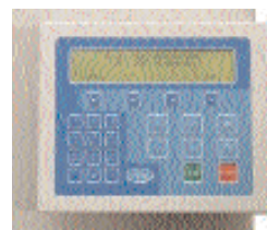
Machine Control Console